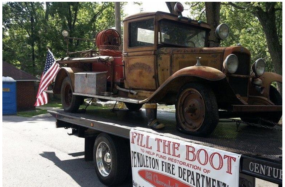
This photo of Fire Engine #2, during a fundraiser, was provided by the PFD

On December 21, 1937, nearly two years after the Town Hall Explosion, while still trying to recover from the devastating loss caused by the explosion, the Trustees met again. The members voted to purchase a 1931 Chevrolet from B&C Chevrolet for $175. An additional funding amount of $1267 was approved to have Howe Fire Apparatus outfit the truck. This fire truck, purchased in 1937, is Fire Engine #2 , and after 84 years of firefighting duty, Fire Engine #2 was brought back to its home in Pendleton on August 29, 2021. For the full story of its journey, please see the article “The Evolution of Pendleton Fire Fighting Equipment”, also researched and compiled by Pam H. Jones, and also linked on this website.