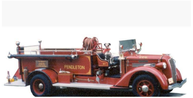
This photo of the Diamond T, Fire Engine #1, was provided by the PFD

On June 30, 1936, the Trustees of the Town of Pendleton held a special session regarding the need to purchase a fire truck to replace trucks lost in the Town Hall Explosion. The members of the board voted to purchase a Diamond T truck chassis from Howe Fire Apparatus in Anderson, Indiana. The truck was purchased for $3757, and is still owned by the PFD; this truck is Fire Engine #1 .